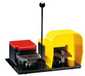
Two pedal, left pedal with free actuation and right pedal with safety lever - left open right with cover KG D003