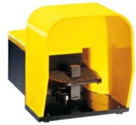
One pedal, with pedal actuator lock - with cover KG220