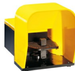
One pedal, with pedal actuator lock - with cover KG220