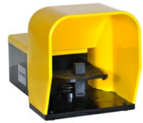
One pedal, with safety lever - with cover KG210