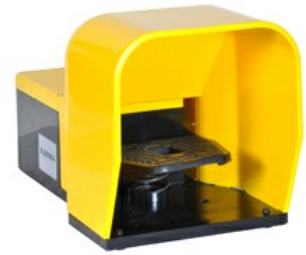
One pedal, with free actuation - with cover KG200