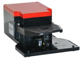
One pedal, with pedal actuator lock - open KG120