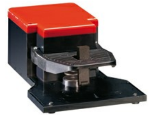
One pedal, with safety lever - open KG110