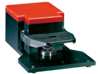
One pedal, with free actuation - open KG100