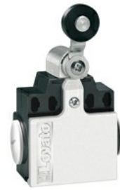
Roller lever plunger KCE