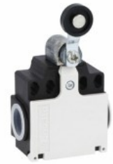
Roller lever plunger KCE