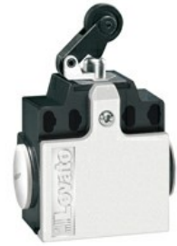
Roller centre push lever KCC