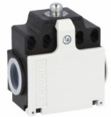
Top push rod plunger KCA