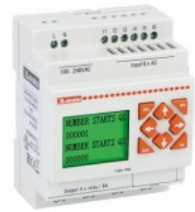
Start-up priority change relay. Modular version LVMP30 Priority change for 3-4 motors