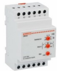
Level control relay for emptying or filling function. Dual voltage. Modular version LVM30 Emptying or filling