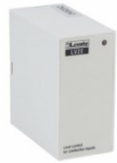
Level control relay for emptying function. Dual voltage. Plug-in version LV2E Emptying