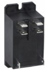
INDUSTRIAL RELAYS ATEX HR8020