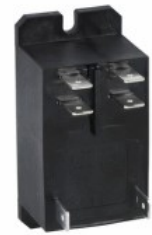
INDUSTRIAL RELAYS ATEX HR8020