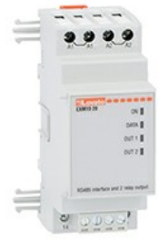
Expansion modules for modular products - communication port EXM1020