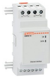
Expansion modules for flush-mount products - communication port EXM1013