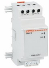
Expansion modules for modular products - communication port EXM1012