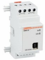
Expansion modules for modular products - communication port EXM1010