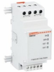
Expansion modules for modular products - inputs/outputs EXM1002