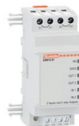
Expansion modules for modular products - inputs/outputs EXM1001