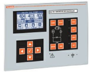
Automatic mains failure gen-set controllers RGK700