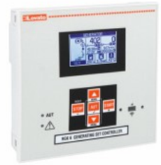
Automatic mains failure gen-set controllers RGK610