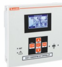
Automatic mains failure gen-set controllers RGK601