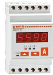
Metering instruments - Ammeter DMK71R1 3