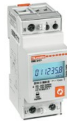
Single-phase energy meters DMED121 single-phase 2