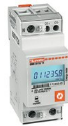
Single-phase energy meters DMED115T1 single-phase 2