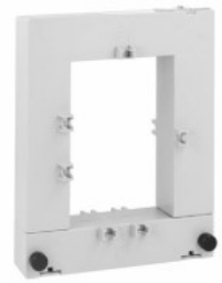
Current transformers DM3TA2000