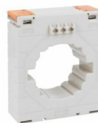
Current transformers DM35T0400