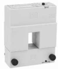
Current transformers DM0TA0200