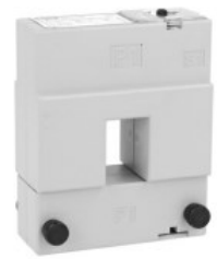
Current transformers DM0TA0150