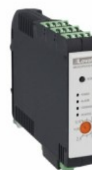
Electronic reversing starter, 2.4A ME024RD024