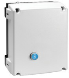
Empty enclosures M3RA