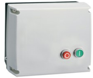
Enclosed star- delta starters M3PA70