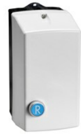
Empty enclosures M2RA