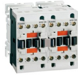
Reversing contactor BFA012