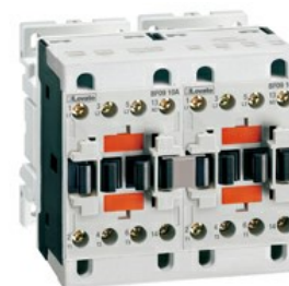
Reversing contactor BFA012