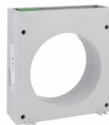
Transformatoare de curent toroidal