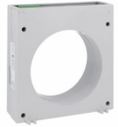
Toroidal current transformers