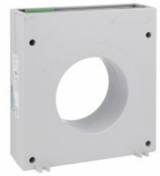
Toroidal current transformers