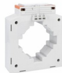
Current transformers DM5TP3000 Solid-core