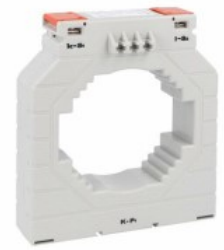
Current transformers DM4T2500 Solid-core