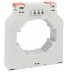
Current transformers DM4T1500 Solid-core