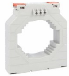
Current transformers DM4T1250 Solid-core