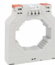
Current transformers DM4T1000 Solid-core