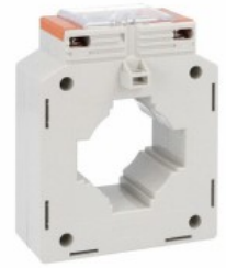
Current transformers DM3TP0600 Solid-core