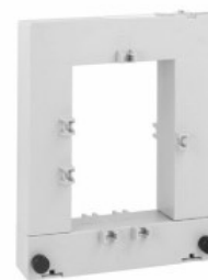
Current transformers DM3TA2000 Split-core