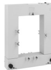
Current transformers DM3TA1500 Split-core